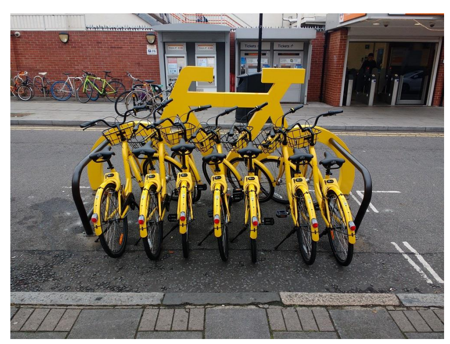
On-street parking area for Ofo, a dockless cycle hire service.