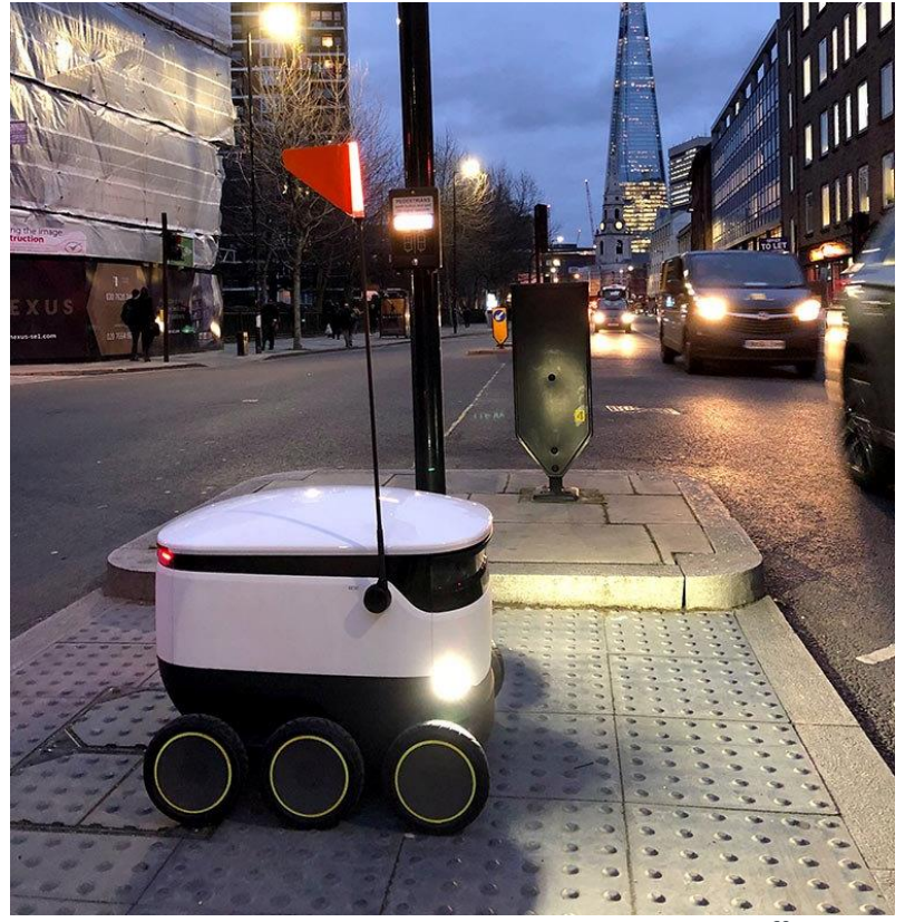
Starship delivery robot at pedestrian crossing, Southwark<sup>60</sup>

undertaken per item is much higher. Furthermore, drones are not likely to have as long a range as road vehicles, in large part because of battery life.<sup>59</sup>