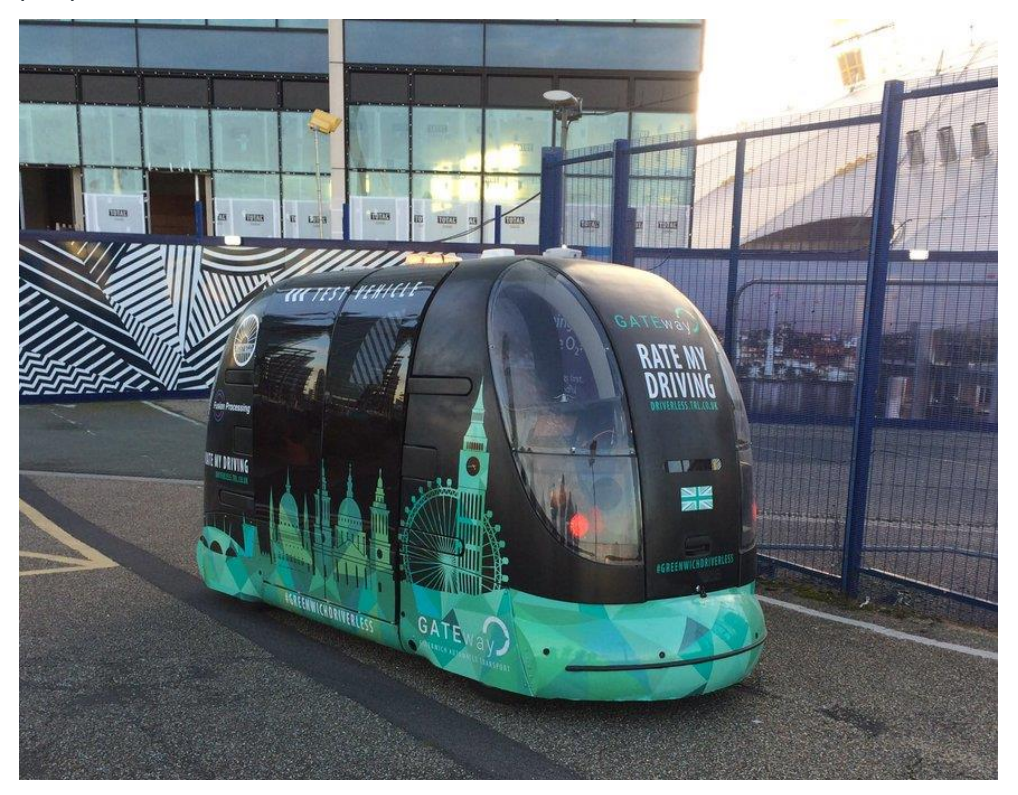
Autonomous vehicle trial run by the GATEway project in Greenwich.

digital literacy that may continue to exclude many older and disabled people.<sup>19</sup>